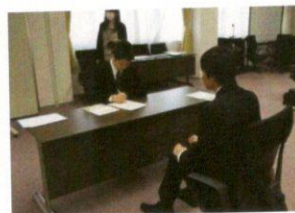
2 nd Selection Technical Interview