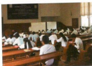
IELTS &amp; Math Test