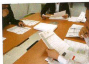
1 st Selection Document Screening