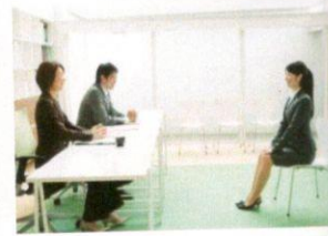
3 rd Selection Comprehensive Interview